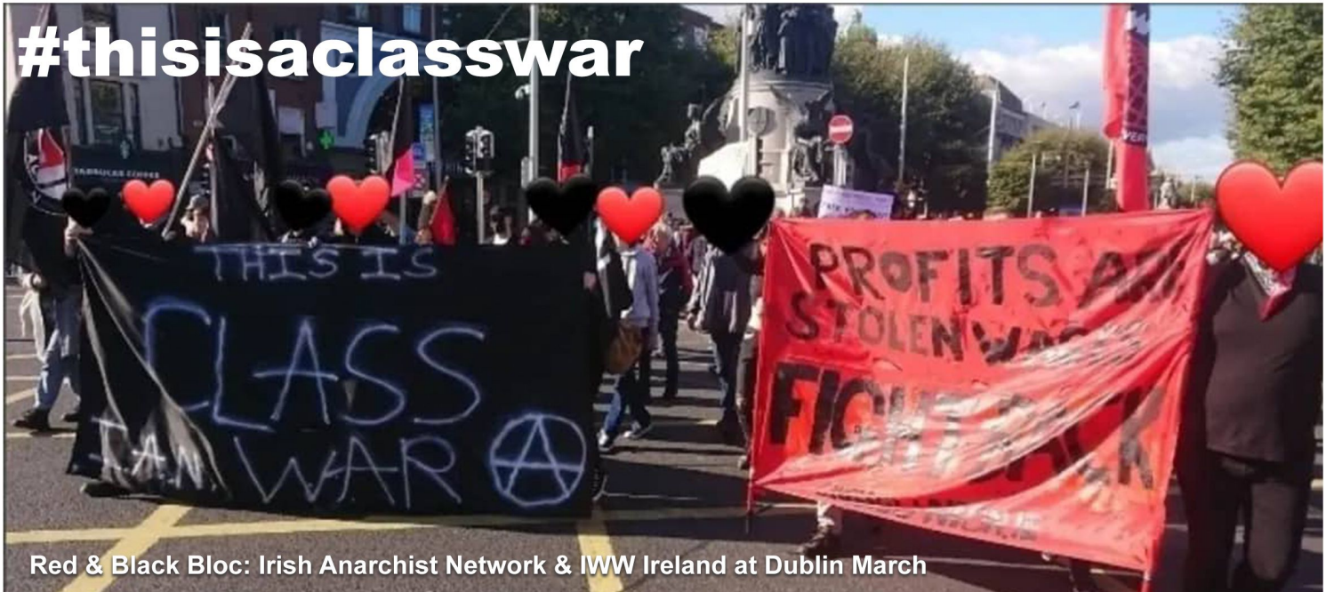
Red & Black Bloc: Irish Anarchist Network & IWW Ireland at Dublin March

Just last month members of the Irish Anarchist Network joined forces with the Industrial Workers of the World to take part in the national Cost of Living Coalition march and rally against the rising cost of survival in Ireland.